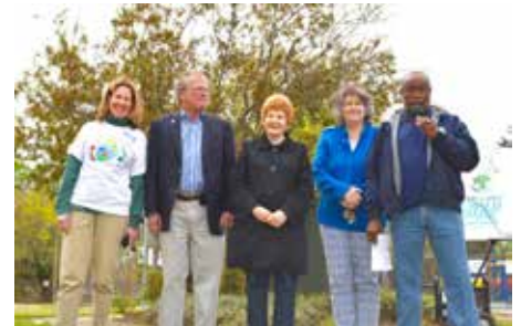
Ewald Park fundraiser with CSCA.