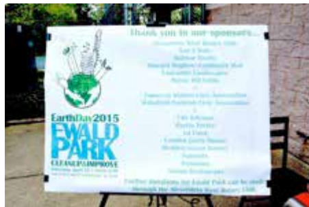
List of sponsors and supporters of the clean-up event.