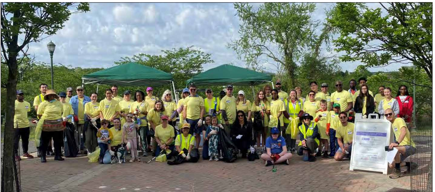
Caption: Cameron Station CA volunteers.

The event would not have been a success without the support of WMCCAI, Cameron Station Community Association, the City of Alexandria, CAMP, Lancaster Landscape and the fifty (50) volunteers who said "YES" to make this event happen. Thank you all again for showing up and giving your support!