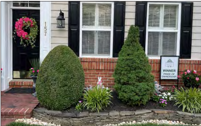
Cameron Station Blvd.