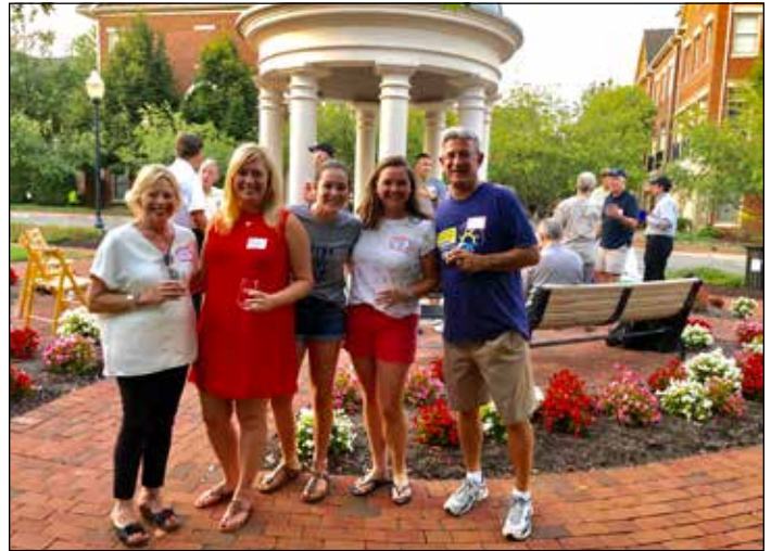
Ticer/Tull Pocket Park Party.

Movie Mavens National Night Out Oktoberfest Oscar Night party Pocket park parties Progressive dinners St. Patrick's Day parties Stroller Strides Super Bowl parties Toga parties Town Hall meetings Trivia nights Walking club Wine Wednesdays at Cameron Café Workout Parents Y2K party Yard sales