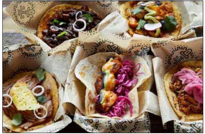
Tacos from Taqueria Picoso – a fiesta for your taste buds!

Taco Rock - (multiple locations). The closest to Cameron Station is 6550 Little River Turnpike, Space 50, Alexandria, VA