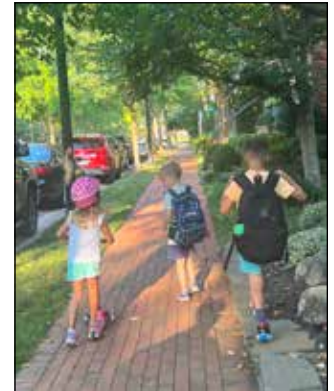
Congratulations to the 2023-2024 Tucker Tigers on starting school this July!

I Am Brave, Important Capable, Smart, Confident, and Unstoppable. A Tiger Who Has Heart!