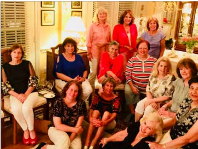
Reading Between the Wines Book Club Meeting.

Easter Egg hunt Game nights Gourmet club Halloween parties Hayrides Holiday decoration competitions Happy Hours at Cameron Café and IndoChen Holiday dinners and parties Inauguration celebration International Fashion Show Martini Mondays