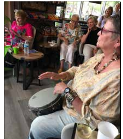
Wine Wednesday at Cameron Café.