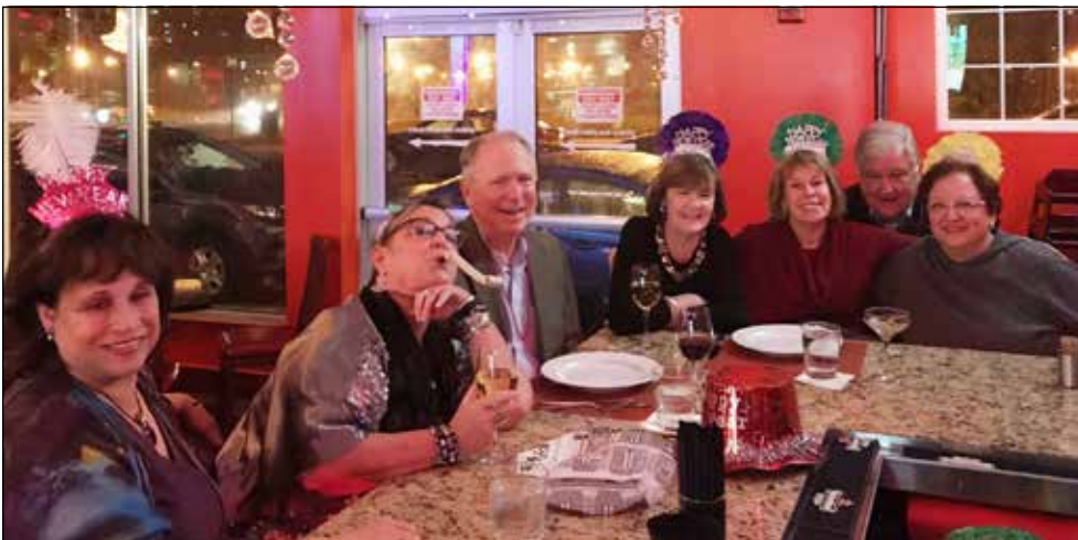
New Year's Celebration at London Curry House (now IndoChen).