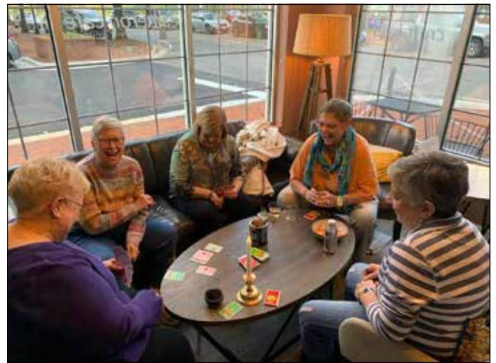
Game Night at Cameron Café.