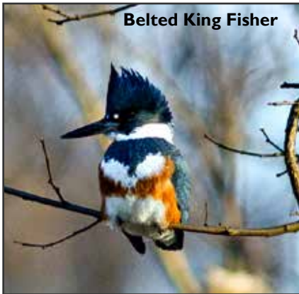
Belted King Fisher