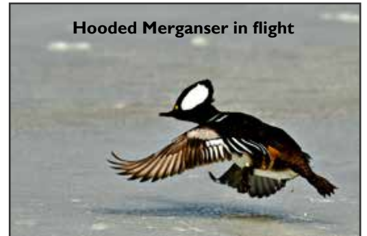
Hooded Merganser in flight