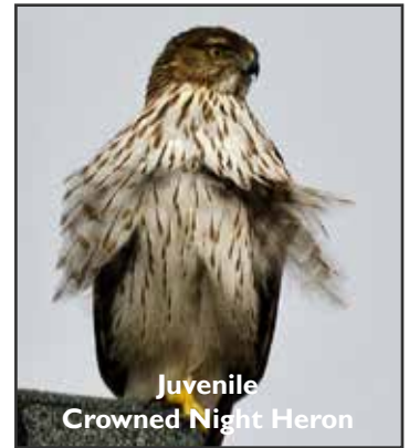
Juvenile Crowned Night Heron