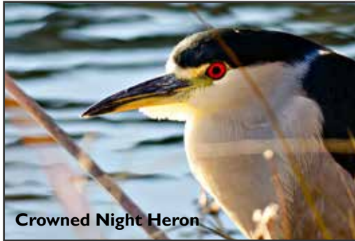
Crowned Night Heron