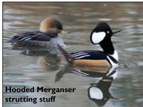
Hooded Merganser strutting stuff